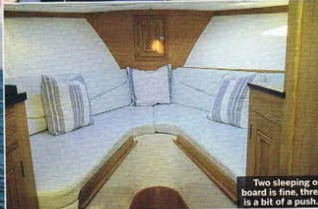
Two sleeping on board is fine, three is a bit of a push...