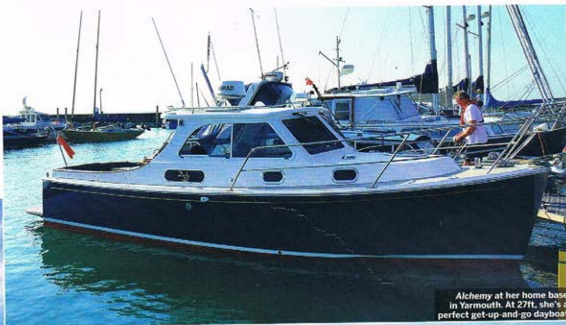
Alchemy at her home base in Yarmouth. At 27ft, she's a perfect get-up-and-go dayboat

Switching from a sports cruiser with a top speed of 40 knots and very comfortable overnight accommodation to a motor launch/dayboat with a top speed of 22 knots has proven to be just the elixir we needed to start our retirement and be as spontaneous as we hoped. Phyllis Rock