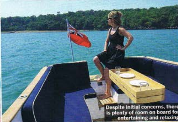
Despite initial concerns, there is plenty of room on board for entertaining and relaxing

After a summer that included more boating days out than ever before, we've also got rather intrepid, trying out overnight trips on our little launch