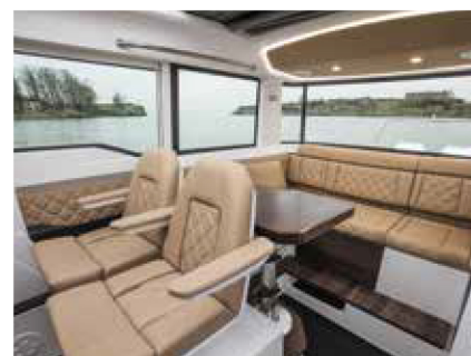
The striking new 37XC Cross Cabin has a sliding canvas roof to open up the deckhouse

Redesigned from the hull up for superb stability in rough seas and sporty handling with phenomenal grip, the distinctive Axopar 37 comes in three models. The Spyder has an open cockpit, the Cross Cabin has a new enclosed deckhouse and the Sun-Top is the best bet for watersports. The ergonomics have been improved for the driver, with better all-round vision, and the forward cabin now sports a cool gullwing door. axopar.fi