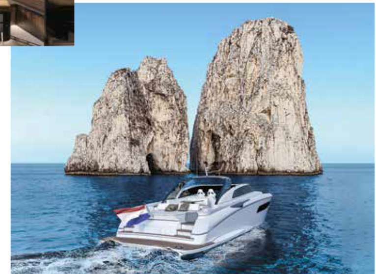
Hull lines of the Libertas are by Van Oossanen, while Cor D Rover has designed everything else

LOA 14.5m DISPLACEMENT 11,500kg TOP SPEED 38 knots PASSENGERS 14 PRICE €895,000 ex. VAT