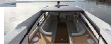
One half of the two-part glass roof slides open to bring the elements into the saloon

LOA 8m DISPLACEMENT 3,325kg TOP SPEED 37 knots PASSENGERS 10 + 2 PRICE approx £1.2m